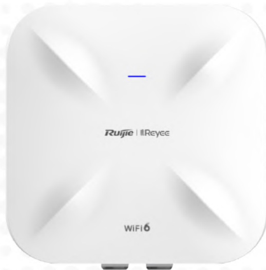
Figure 1-1 RG-RAP6260(G)