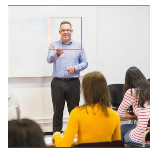
AI-based Smart Face Tracking Al-based smart face tracking keeps the selected presenter in the frame as they move around the room.