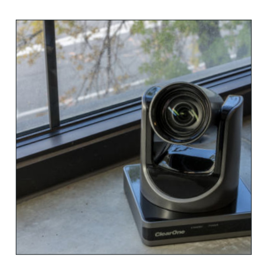
Plug-and-play Simple USB 3.0/2.0 compatibility with UVC and UAC protocol support.

Transforms any meeting room into a professional-grade video collaboration room.